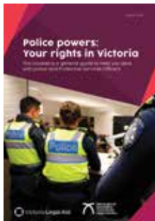
Police powers: your rights in Victoria