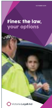
Fines: the law, your options